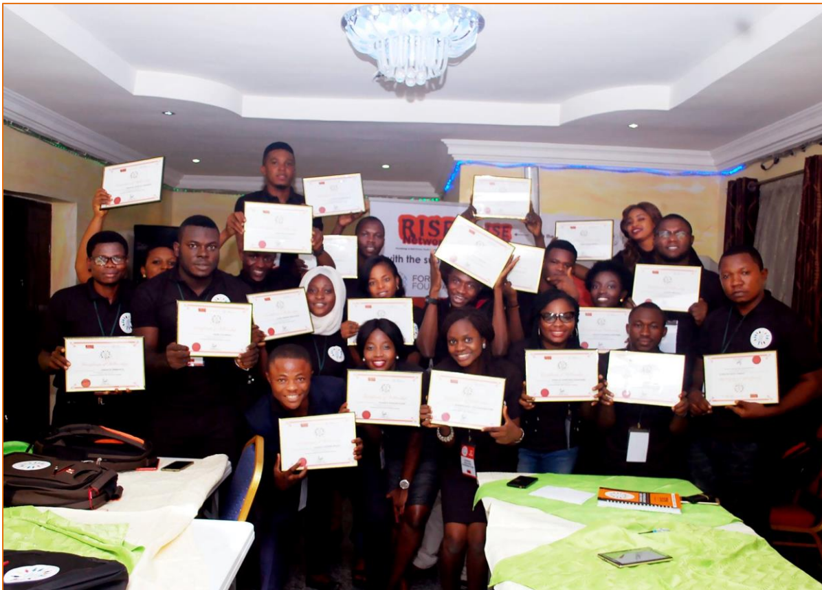
Group Photograph of the 2016 Class of The Nigerian Students Leaders Fellowship Program